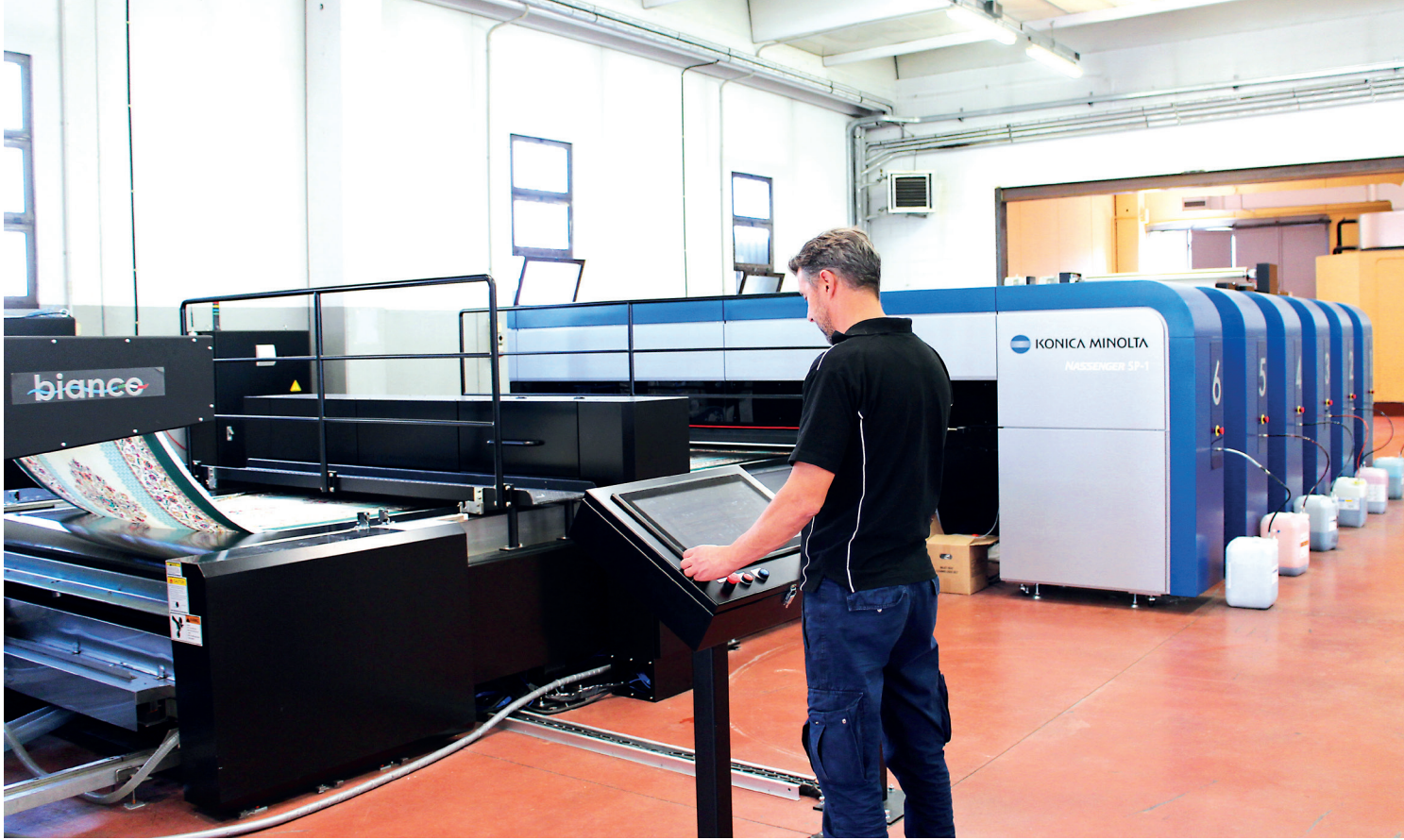
Above: Nassenger SP-1, an ultra-high-speed inkjet textile printer that uses a single-pass system